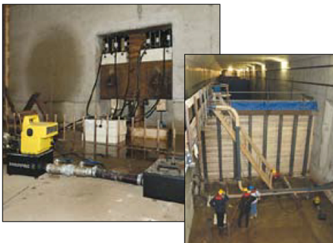
◀ The unique Enerpac RA-Series cylinders – lightweight and entirely made of aluminium alloy – these RAC-506 cylinders are ideal for the positioning of tunnel elements under the river. (High Speed Train Line, The Netherlands)