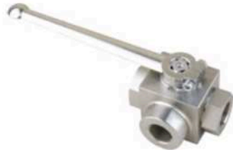
Without Mounting Holes