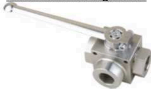
With Mounting Holes